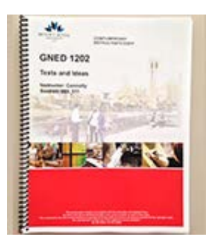
Coursepack (Herodotus, Sophocles, Thucydides, Boccaccio, Vasari, Hall)